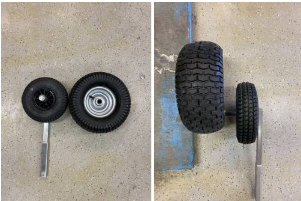
High wheels compared to the standard wheels.

Can only be mounted with the wheel upwards.