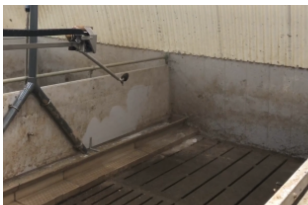
This picture shows when we moved the tower from the right side to the left side of the pen.

5. Turn the water back on with the button on the joystick.