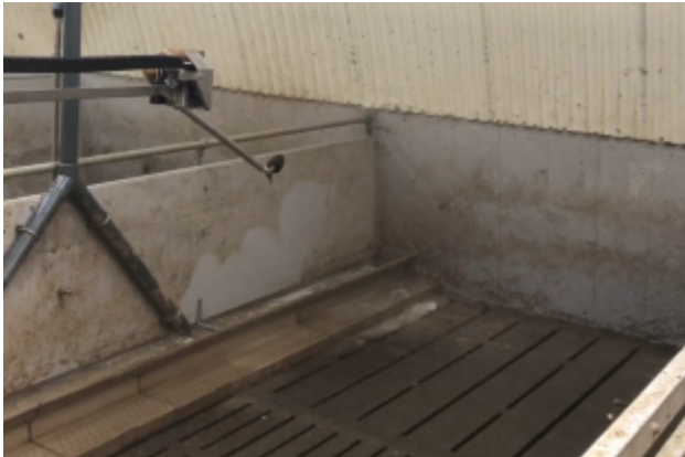
This picture shows when we moved the tower from the right side to the left side of the pen.

nozzle in the right position. This means that the water will come back out from the nozzle we just used if the procedure is made to quick. The 5 seconds movement with the tower or boom is to prevent this from happening.