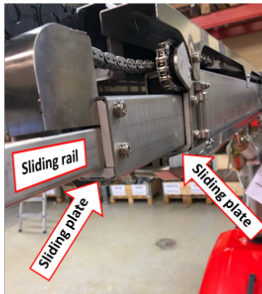
plate is mounted with four screws underneath.